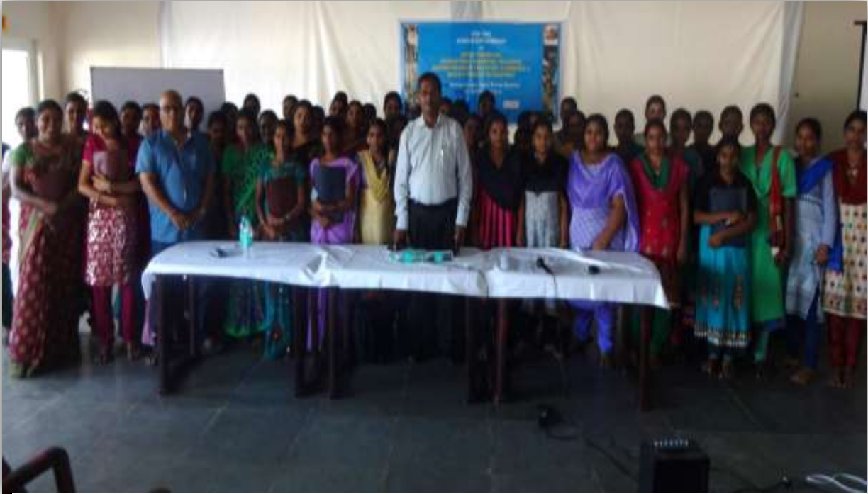
Group Photo of Workshop