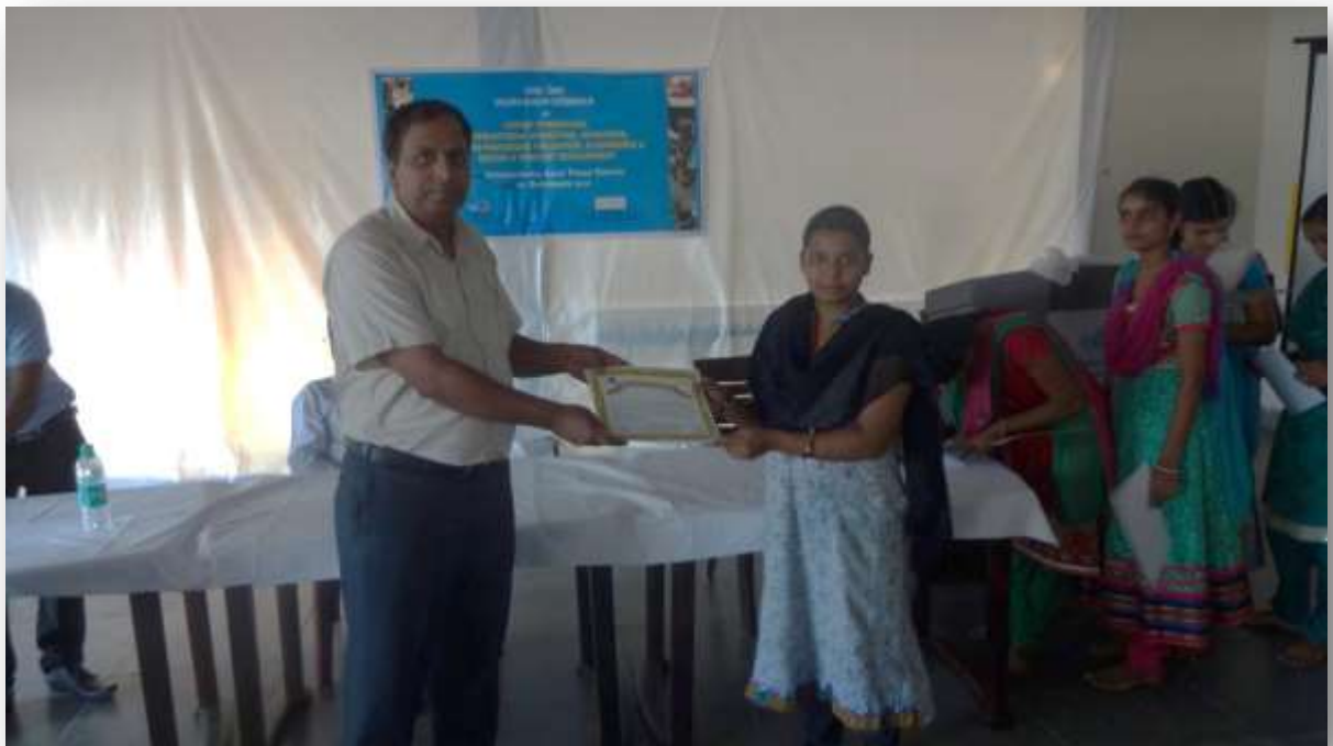
Distribution of Participation Certificate