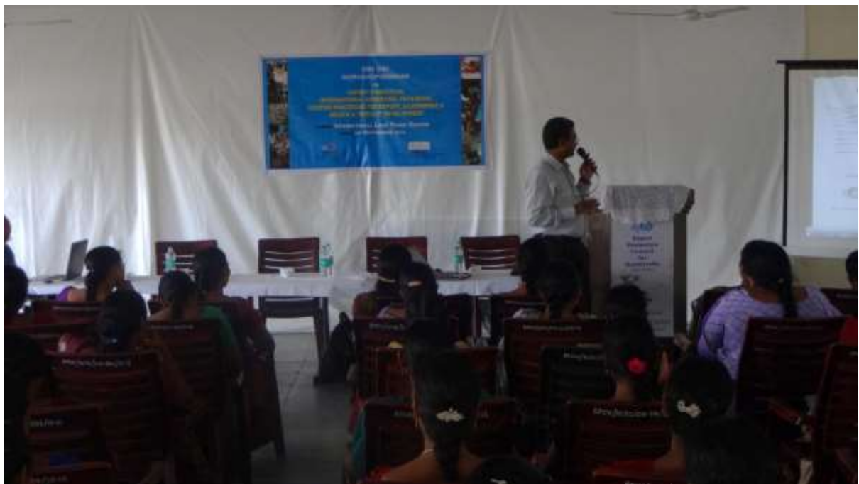
Seminar in progress