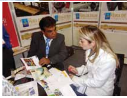
A trade visitor gathers information about IHGF Delhi Fair

confidence and general dissatisfaction with the government, many poorer Brazilians have been able to take advantage of new assistance programmes to purchase appliances and other big-ticket items for the first time.