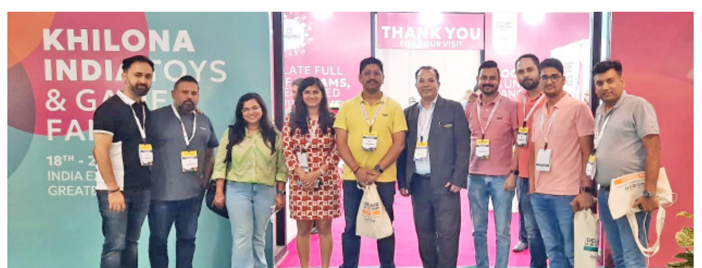
A delegation of buyers from Hamleys (buying and sourcing team), Amazon, Lulu International Mall, Reliance Retail, IKEA, Skechers and ITC group visited Khilona-India Toys & Games Fair and did business with the exhibitors

Besides direct buyers and brand representatives, the fair saw toy collectors and enthusiasts visiting the stalls with a lot of nostalgia and enthusiasm. While heritage dolls and handmade mechanised toys from yesteryears got their share of attention, miniature toys and collectors models found many takers. Thanks to technology and design innovation, these segments of toys are getting their facelifts, while retaining originality - all for image enhancement and a well-deserved global presence.