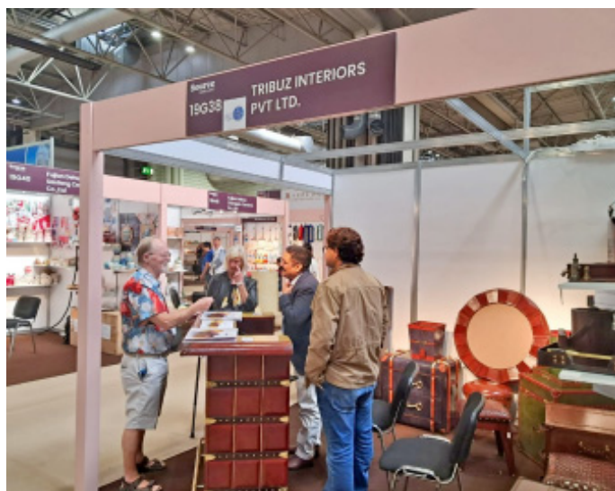
Business visitors interacting with EPCH exhibitors in the EPCH India Pavilion during Autumn Fair International

He appreciated the continuous efforts of the Council for bringing Indian handicrafts to the world markets and promotion of handicraft exports from the country.