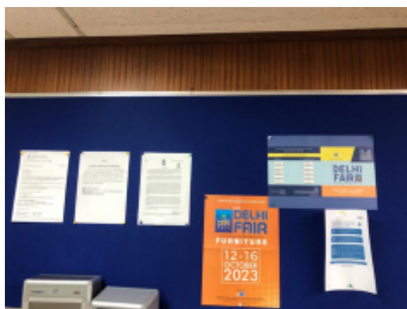
The Office of Consulate General of India also promoted EPCH's upcoming shows and displayed related brochures at their board for all visitors