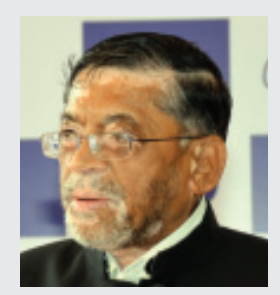
Mr. Santosh Kumar Gangwar Minister of State for Textiles(IC), Govt. of India

The consistent continuity of IHGF has carved its importance in the international market. Participation by larger number of small and medium exporters enables us to showcase and give exposure to innovative and newly designed products and enhance exports.