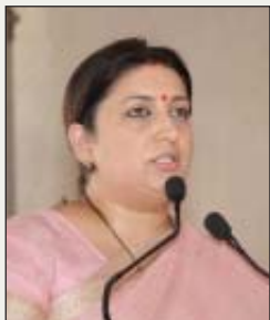
Mrs. Smriti Zubin Irani , Minister of Textiles, Govt. of India

What makes IHGF special is its distinctive feature of seeking to bring the best of Indian businesses under one roof and ensuring that they have traction from buyers across the world. I am happy at the guidance EPCH has offered to the North Eastern Region of India and ensure that they are prominently