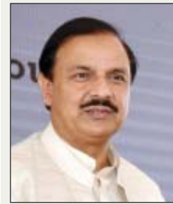
Dr. Mahesh Sharma Minister of State(IC) for Tourism and Culture, Govt. of India

This IHGF saw significant expansion in all categories with a promising array of