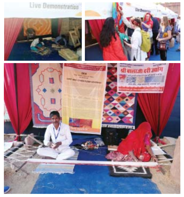
Glimpses of the live demonstration at the RBSM

The RBSM was organised with an aim to provide a marketing platform to crafts persons / artisans, national awardees, NGO's / SHG's, entrepreneurs and manufacturers from the Jodhpur mega cluster. Though endowed with enormous potential, lack of such platforms creates a gap between the artisans and their markets, resulting in non- exposure to export markets, designs and product development. ■