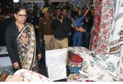
Hon'ble Chief Minister of Rajasthan, Smt. Vasundhara Raje Sindhia visited the fair and interacted with the participants

Convention and Exhibition Centre (JECC), Sitapura Industrial area, Jaipur. Praticipants came from many public sector organisations from over 15 states. Participants from the EPCH Pavilion covered almost the entire handicraft products of Jodhpur Mega Cluster displayed by 20 artisans and 20 member exporters. This comprised woodcraft, artmetalwares, leather handicrafts, durries, embroidery, applique, handprinted textiles and iron crafts.