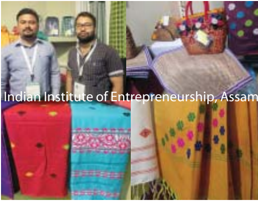
Indian Institute of Entrepreneurship, Assam