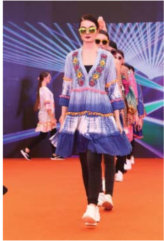
e-CRAFTCIL • Issue 51, 2018