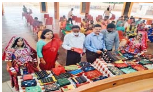
Display of 40 sets of Prototypes developed by the artisans