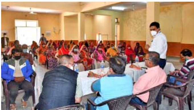
The audience at the inauguration