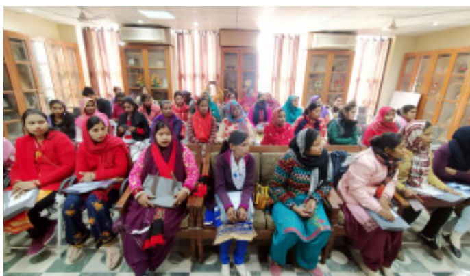
Artisans in attendance at the seminar on 17th & 28th January 2023, respectively