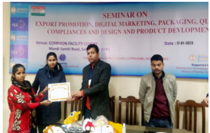
Distribution of Certificate to a participant at the seminar