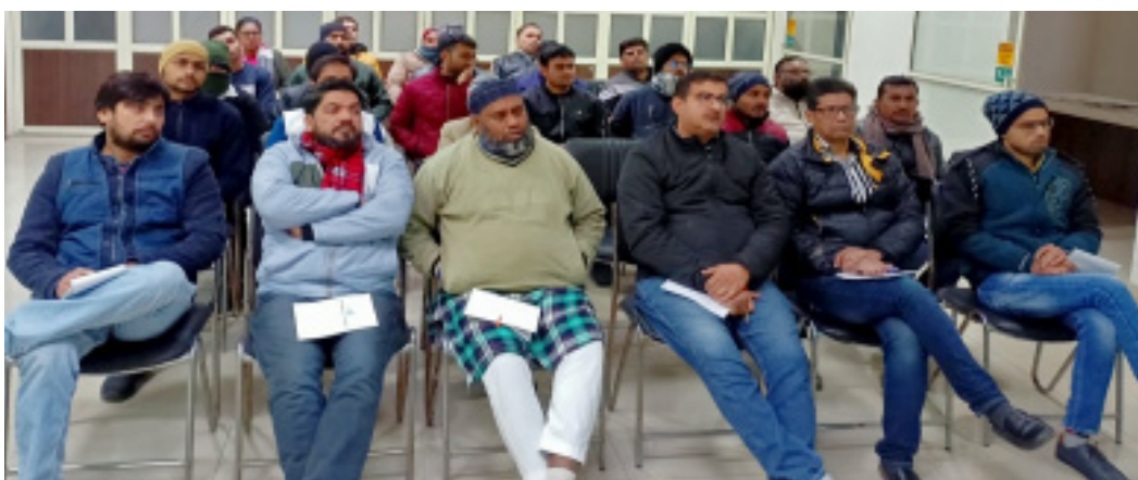
A view of participants of seminar