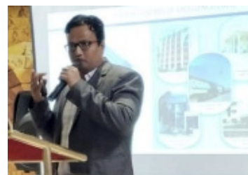
EPCH Jodhpur representative sharing the information with participants of seminar